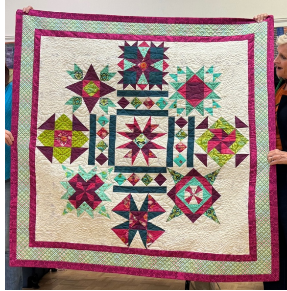
Sue McCollum – Blue and Orange quilt (left); Green and Pink quilt (right)