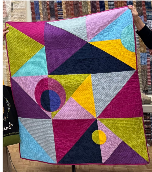
Tracy Phillips – Purple 'Quota' quilt (left); Freeform curves, modern (right)