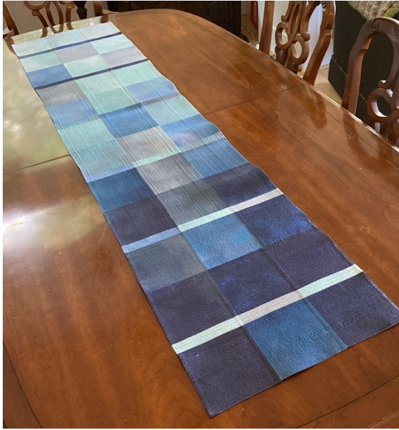
Jess Millikan – Table runner from two workshops/classes