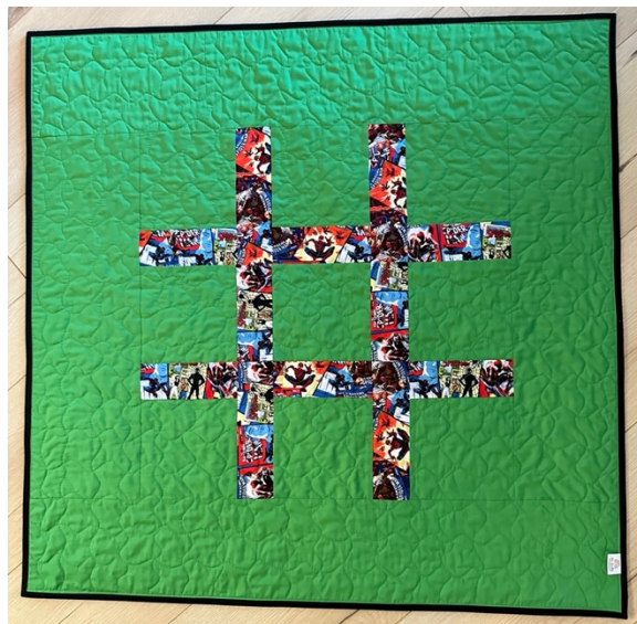
Carlie Peck -- Game Quilt (Checkers on one side; tic tac toe on reverse)