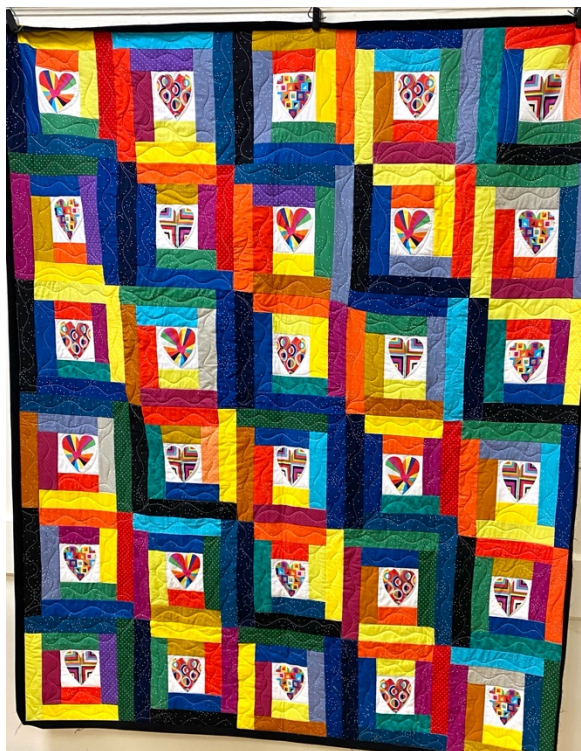
Below: Rose Erdozaincy – Sea Glass from PQ workshop