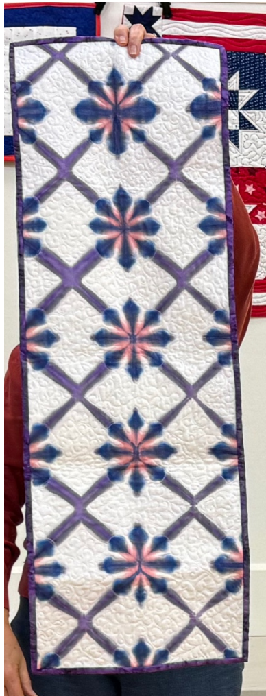
Sue McCollum – Blue/Purple Table Runner (below); Wind Sock (right)