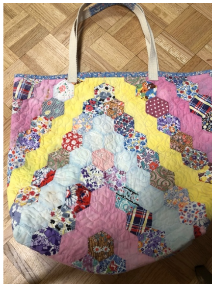
Gale Green -- Disappearing Nine-Patch (left) and Replacement Antique Tote (right)