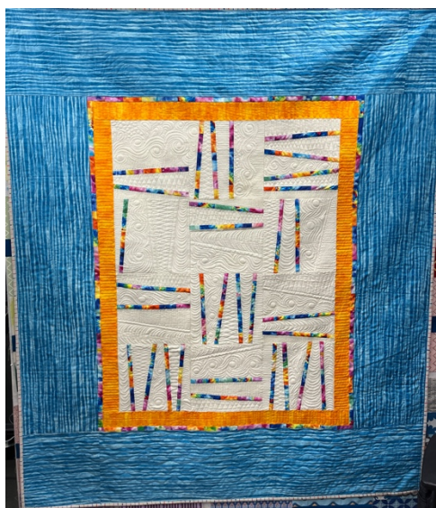
Gretchen Michaels -- Sticks