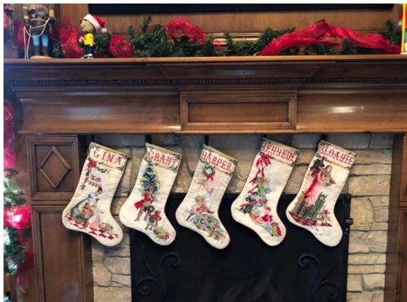
Below: Angie Merlone-- 5 Christmas Stockings Right: Sandy Kelly -- Christmas tree wall hanging