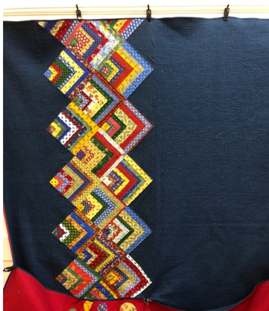
Left: Mavourneen Lopez – Fall Leaves; Right: Provencal Log Cabin in blue background