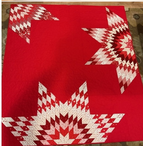
Left: Rose Erdozaincy -- Red Stars called Red Hot Tamale