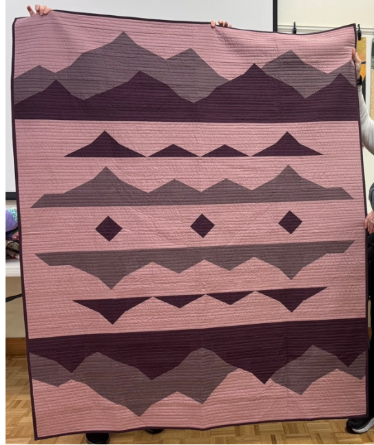
Carly Peck – HST Star with CatNap fabric (left); Glacier National Park quilt (right)