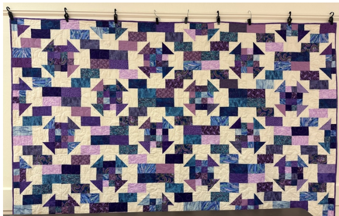
Below: Grace Hardy -- Purple Basket; Right: Barb Hall -- Wonky Cross