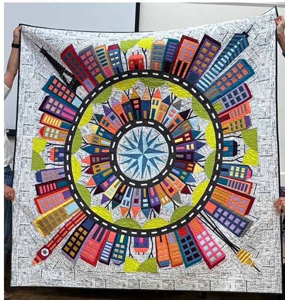
Left: Angie Merlone -- Color California; Right: Kay Pauling -- Australia Tour