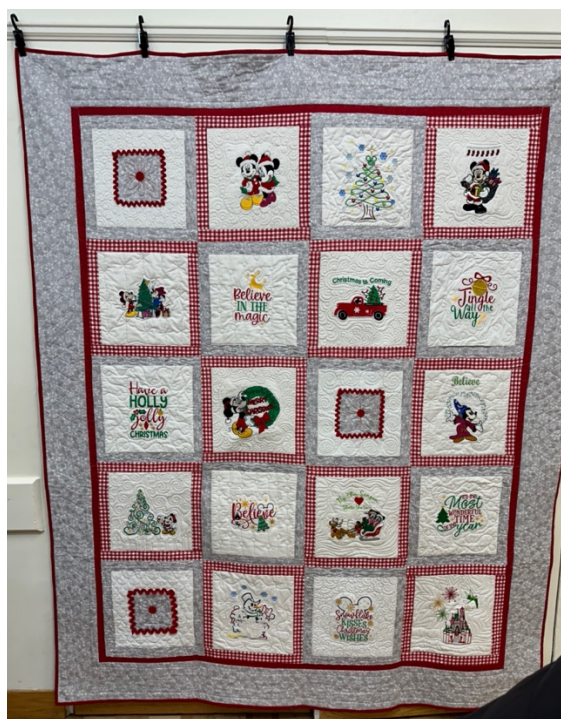
Left: Terry Caselton – Disney-themed Quilt; Below: Ruth Gilroy – Diagonal blocks with different colors