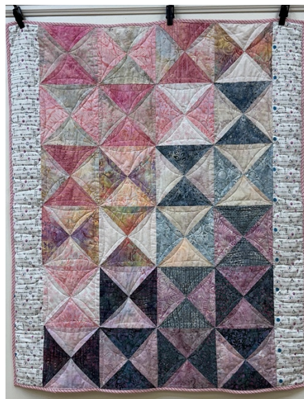
From top left (clockwise): Barb Hall – Cathedral Window; antique clamshells; Antique Star from antique shop, Pink and Gray