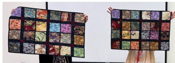
Lorraine Twomey – King-sized Japanese Kimono quilt with shams and pillowcases