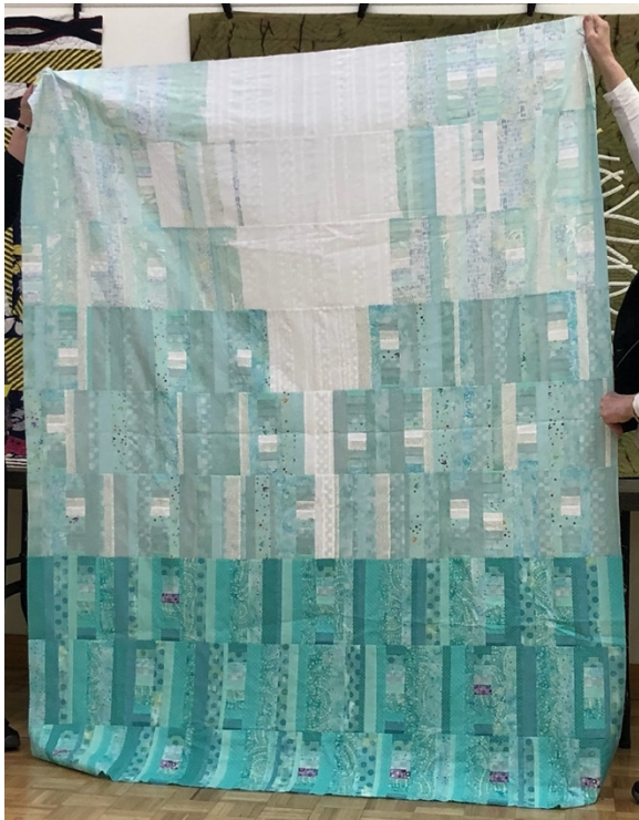
Left: Theresa Koettters -- Waterfall in sea glass blues/greens; Right: Grace Hardy – wall hanging