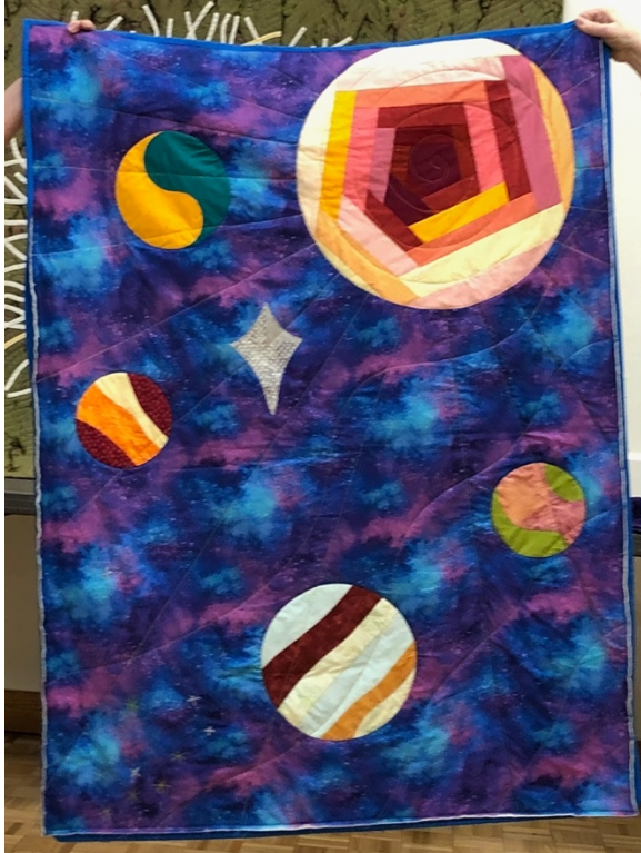
Left: Nell Lee Stinson – Solar System Quilt; Below: Sandy Kelly – Black and Blue