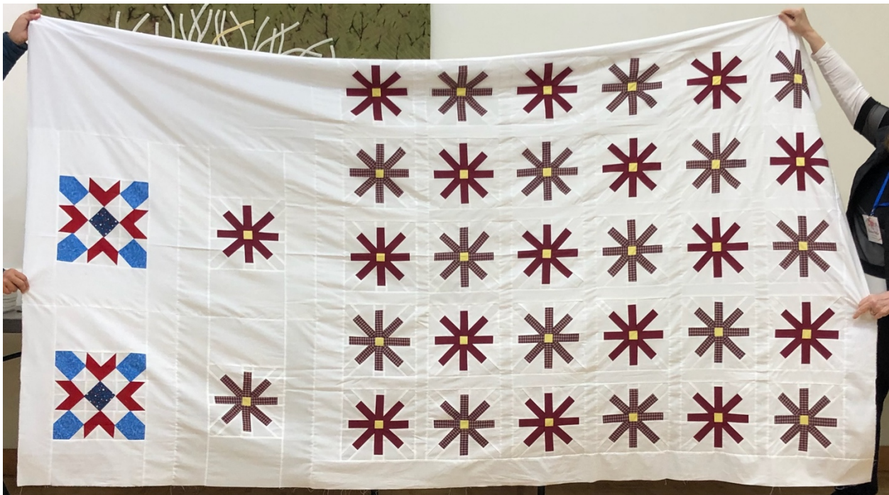
Lorraine Twomey – Floral twin quilt and pillow shams, ready for quilting