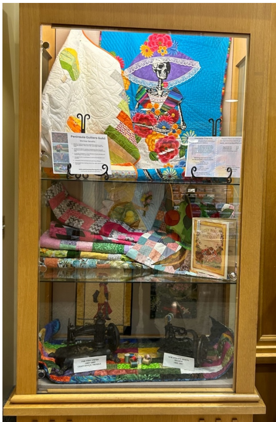
Here are the quilts on display at the Redwood City Library through June 15.