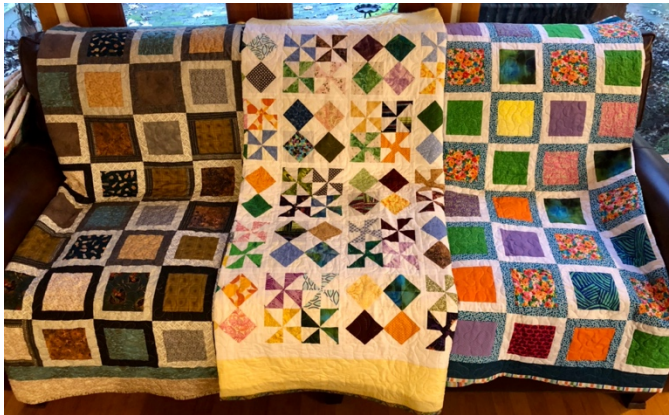
Quilts created by Bee Charitable bee in January