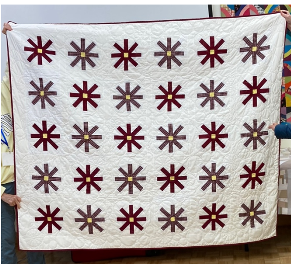
Lorraine Twomey – Maroon Stars/Flowers Quilt