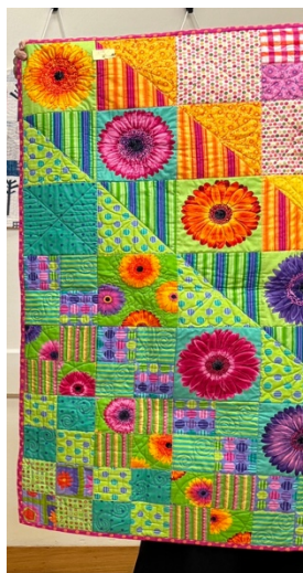
Holly Colgan – 2 Gerber Daisy quilts