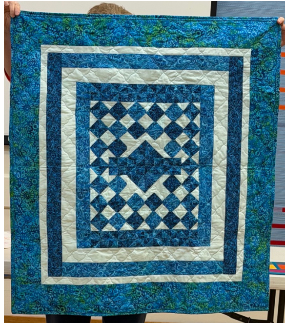
Harriet Hirsch – Blue 3D, corner pieces